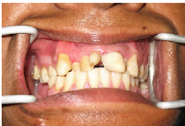
Figure 1: Preoperative frontal view.

oral hygiene, soft tissues of the lips, cheeks, tongue, oral mucosa, and pharynx were normal. The saliva was thin and serous and the patient did not have any addictive habits. Maxillary right canine (13) was in severe labioversion and out of arch form, whereas the left maxillary canine (23) was in slight labioversion. The maxillary left (12) and right lateral (22) incisors were lingually placed and in crossbite, while the maxillary right central incisor (11) was lingually placed, rotated and in crossbite by about 4 mm. The maxillary left central incisor (21) was bulky and massive in mesio-distal dimension (13 mm) and appeared to be a fusion of the central incisor and a mesiodens (Fig. 1 and 2). Further exploration revealed that the tooth was fractured, and removal of the mobile mesio-lingual chunk leads to less than one-third coronal structure remaining. Another mesiodens was present between teeth 11 and 21. The mandibular arch was partially dentate with teeth 37, 36, 46, 47 and 48 missing. Periodontal examination revealed presence of shallow to moderately deep pockets in relation to all the teeth. The patient was unable to move his mandible in anterior guidance because of the locking effect of his lateral incisors.