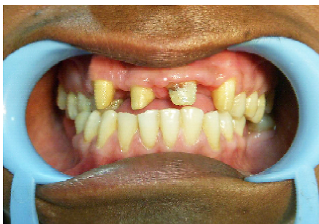
Figure 3: Intraoperative view of prepared abutments