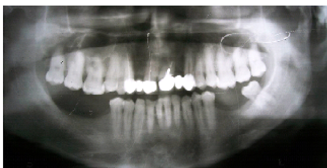
Figure 4: Post-operative OPG