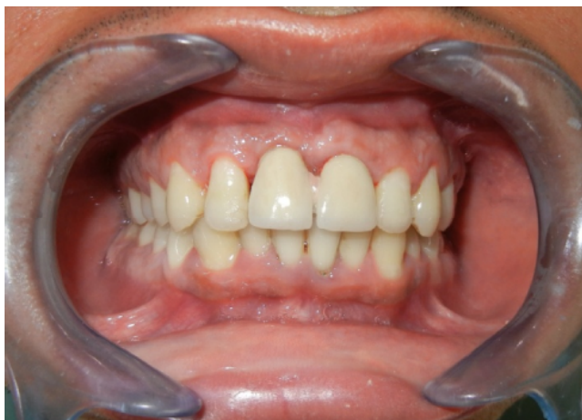
Figure 4: Joint metal ceramic crown in relation to 11,21.

given as a permanent splint in 11 and 21 (Fig. 4). Two-years after the treatment, patient was asymptomatic, and did not report any mobility or tenderness on percussion. Also, radiographic healing was evident as there was rounding of margins at the fractured ends and no untoward periapical changes had occurred (Fig.5).