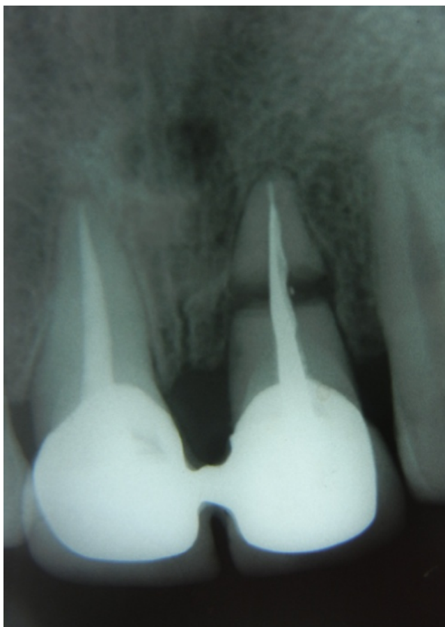
Figure 5: Two year follow-up radiograph.