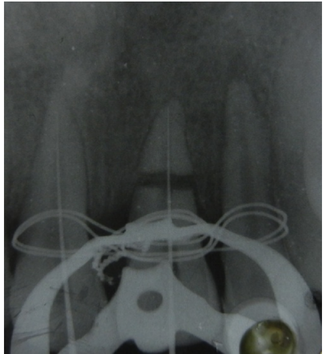
Figure 2: Fractured fragments by-passed with a K-file.

GC, Tokyo) (Fig. 3). The wire splint was replaced by a fibre splint Interlig, Haeger) and bonded from canine to canine. After a 3 month follow up, joint metal ceramic crowns were